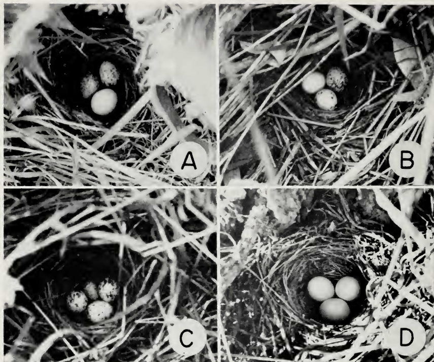
FIG. 1. Parasitized nests of sparrows. A: 2 sparrow eggs, 1 immaculate cowbird egg. B: 2 spotted and 1 immaculate cowbird eggs. C: 1 sparrow egg and 3 rather similar spotted cowbird eggs. D: 3 immaculate cowbird eggs; later 2 spotted cowbird eggs were also laid in this nest.

the nests of Rufous-collared Sparrows, only 1 cowbird egg was considered to be intermediate, having a white ground color with 7 small deep brown spots. In my experience immaculate and spotted eggs are better regarded as discontinuous or quasi-discontinuous forms. This basic variation seems to be a true genetic polymorphism (Ford 1965). The possible selective forces that maintain this polymorphism are unknown. Immaculate eggs are strikingly different from the eggs of the local hosts of the Shiny Cowbird. Hudson (1920 I:124-126) suggested that some host species may selectively reject or eject the immaculate eggs. At least 3 species among the recorded local hosts may eject cowbird eggs and at the present time I am investigating this point in the Chalk-browed Mockingbird. The Rufous-collared Sparrow is a poor subject for such studies, as it accepts eggs of both types.